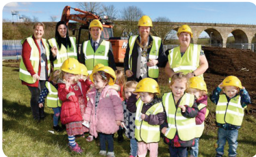
Lainshaw Early Childhood Centre

Young construction workers in the making! akp had a photoshoot with East Ayrshire Council to promote the new builds. The staff and children were excited at their new development.