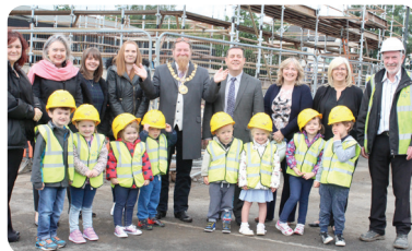
Cairns Early Childhood Centre