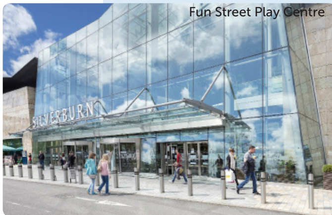
Fun Street Play Centre