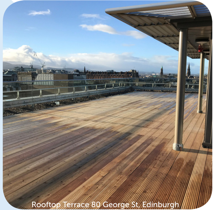
Rooftop Terrace 80 George St, Edinburgh

April 2019 saw akp commence its inaugural project as part of Registers of Scotland (RoS) Framework, which will include small to medium works across the RoS Estate.