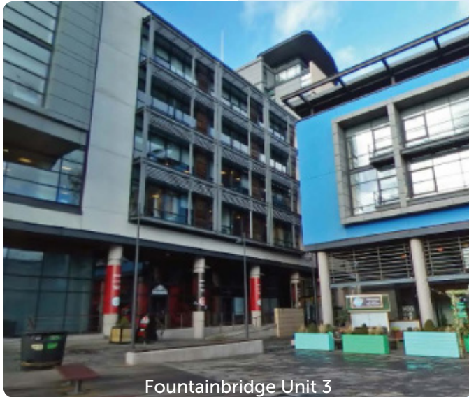
Fountainbridge Unit 3