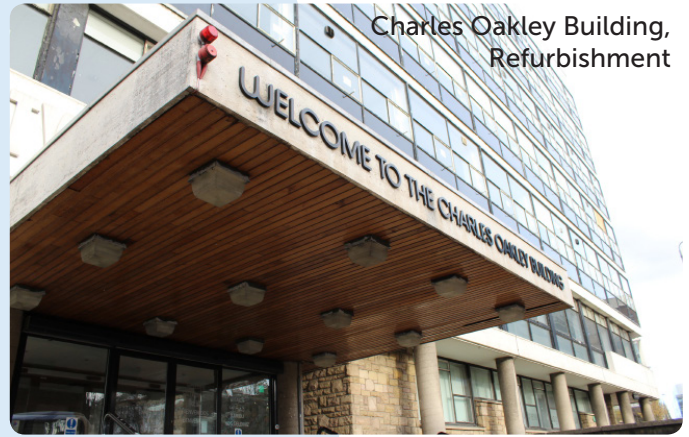
Charles Oakley Building, Refurbishment