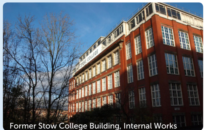
Former Stow College Building, Internal Works