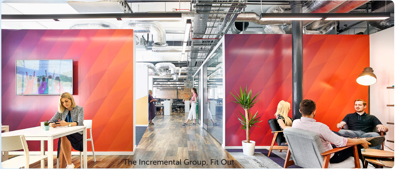
The Incremental Group, Fit Out