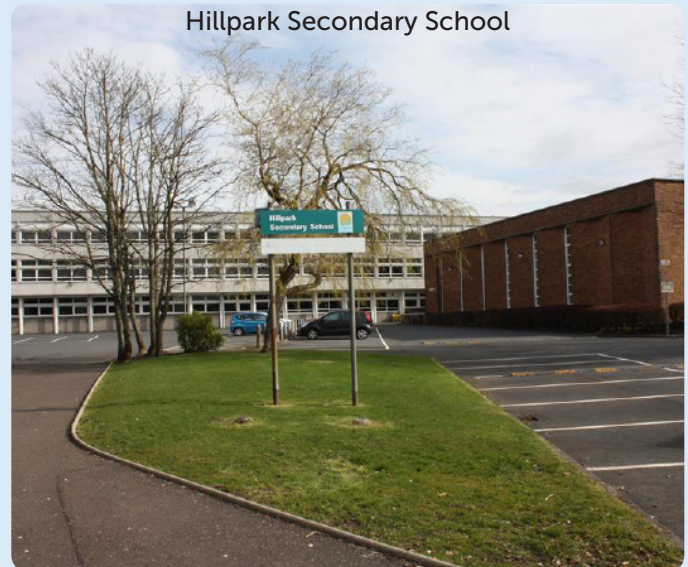
Hillpark Secondary School