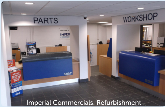
Imperial Commercials, Refurbishment