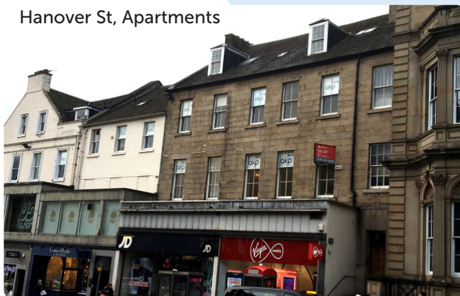
Hanover St, Apartments