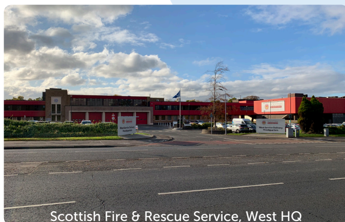
Scottish Fire & Rescue Service, West HQ