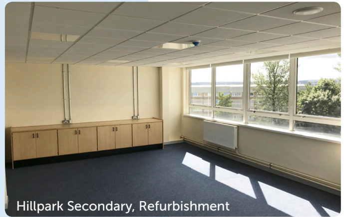
Hillpark Secondary, Refurbishment