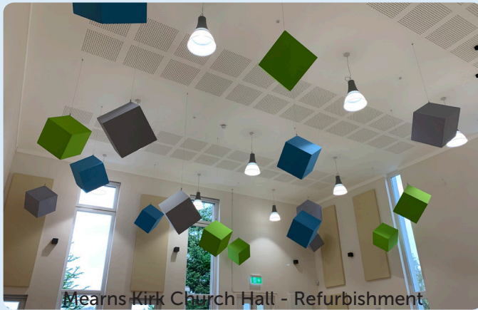
Mearns Kirk Church Hall - Refurbishment