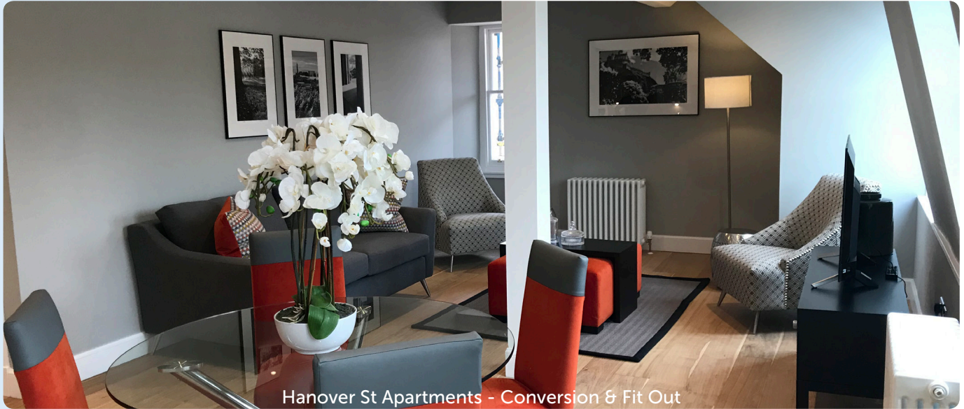
Hanover St Apartments - Conversion & Fit Out