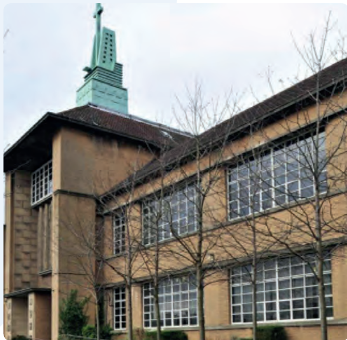
Notre Dame High School

We look forward to showcasing these projects fully in the coming month