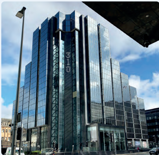
310 St. Vincent Street